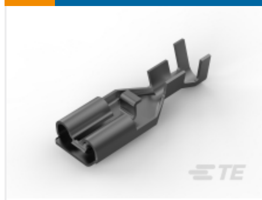
TE Part # 179974-1 250 PL EX REC. 18-14AWG PTBR