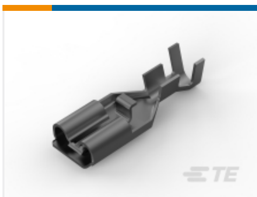
TE Part # 179974-6 250 PL EX REC. 18-14AWG PTBR