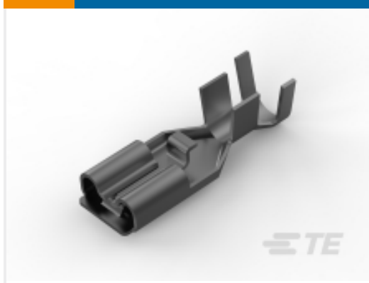
TE Part # 179975-1 250 PL EX REC. 15-10AWG PTBR