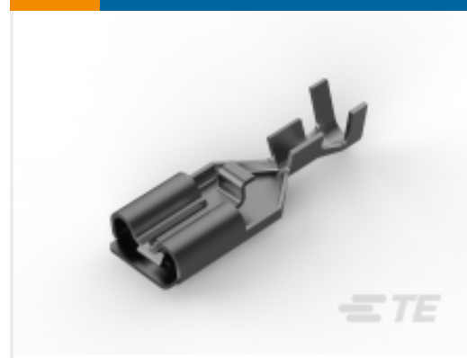
TE Part # 179973-6 PL EX 250 REC 22-18 PTPCOPPER-ALLOY