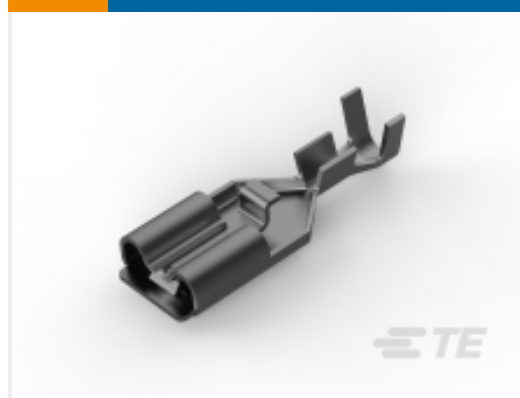
TE Part # 179973-1 250 PL EX REC. 22-18AWG PTBR